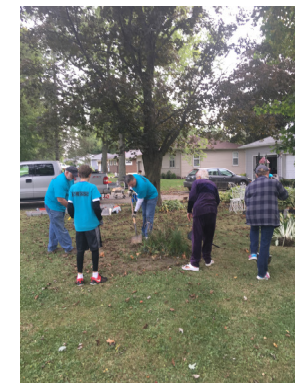
Faith Baptist GO Day September 22, 2018