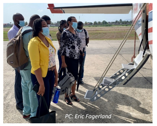
Danita's Children medical staff praying before flight

schools. Three days after the quake, tropical storm Grace dumped some 10 inches of rain on that part of Haiti, triggering mudslides, hampering relief efforts—already slowed by damaged bridges and roads, as well as gang violence that has been rising in recent years!